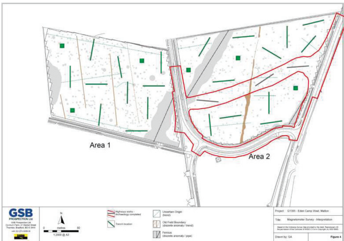
Figure 1: Proposed trench plan overlaid on geophysical survey interpretation. Red outline marks position of completed highway works zone